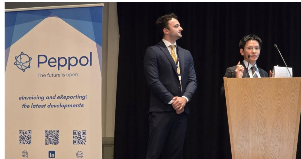
Japan’s Session with a Japan Peppol Team Member